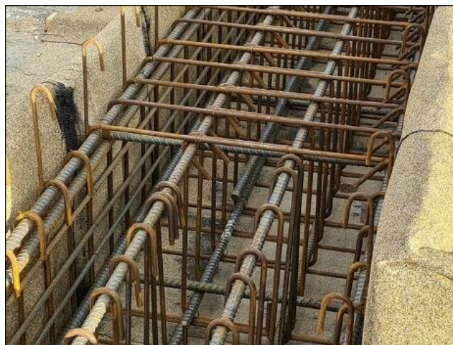
DeboFlex 3.5 Special granules offer protection against damage