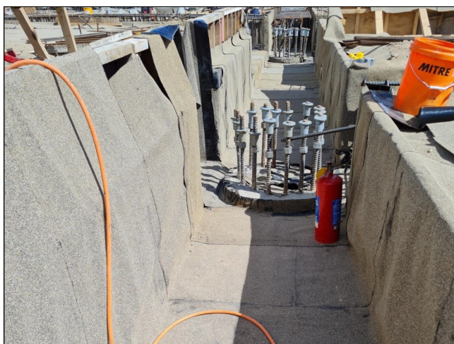
DeboFlex 3.5 Special laid in removable formwork