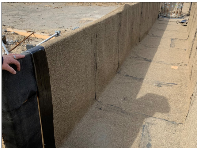
DeboFlex 3.5 Special loose laid into the formwork